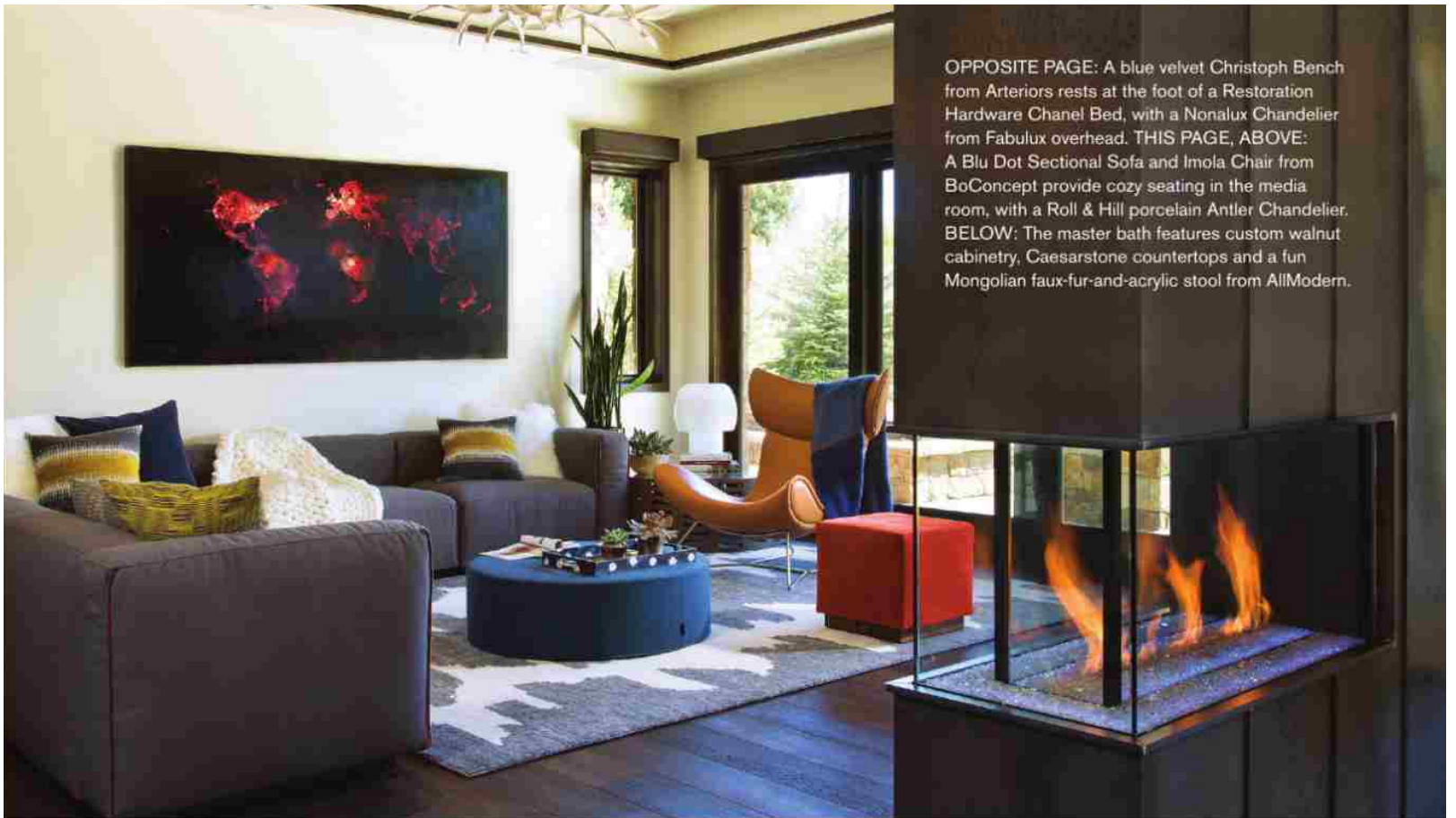
OPPOSITE PAGE: A blue velvet Christoph Bench from Arteriors rests at the foot of a Restoration Hardware Chanel Bed, with a Nonalux Chandelier from Fabulux overhead. THIS PAGE, ABOVE: A Blu Dot Sectional Sofa and Imola Chair from BoConcept provide cozy seating in the media room, with a Roll & Hill porcelain Antler Chandelier. BELOW: The master bath features custom walnut cabinetry, Caesarstone countertops and a fun Mongolian faux-fur-and-acrylic stool from AllModern.