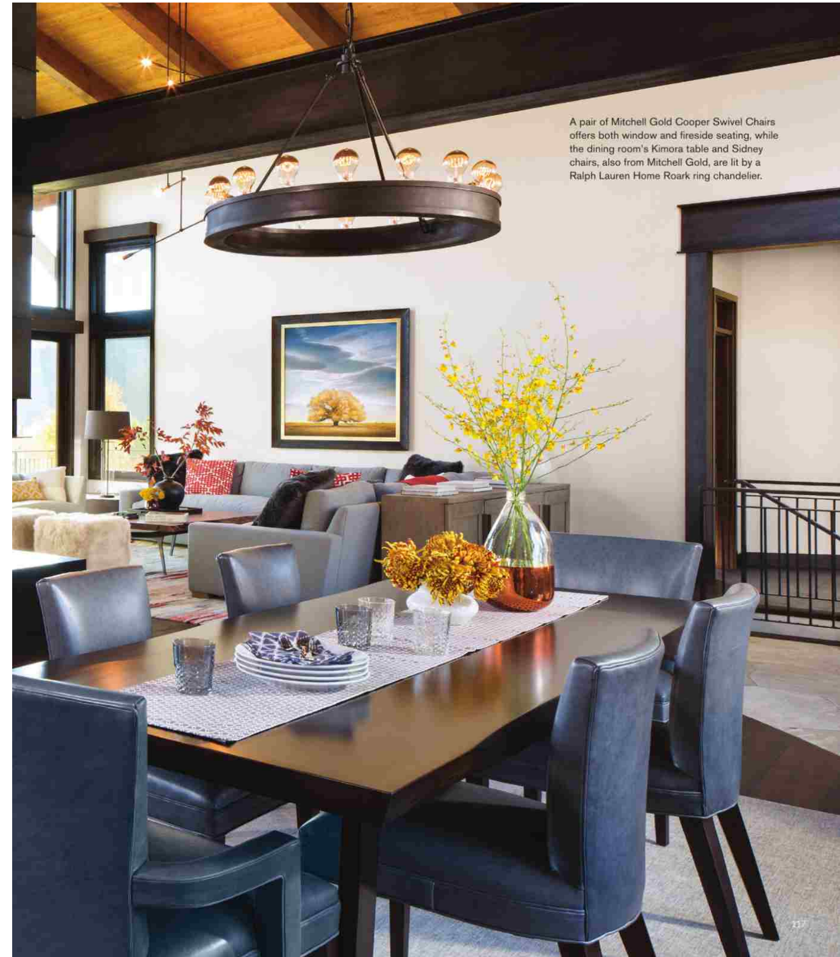
A pair of Mitchell Gold Cooper Swivel Chairs offers both window and fireside seating, while the dining room's Kimora table and Sidney chairs, also from Mitchell Gold, are lit by a Ralph Lauren Home Roark ring chandelier.